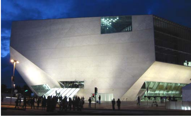
Fig.1 Casa da Musica Building 1

The final implementation consists of a Disklavier Piano controlled via MIDI by a server that simultaneously can be used as a terminal, located at the main foyer of Casa da Musica. This server accepts incoming control data generated by 10 client computers located in diverse points of the hallways of a scenic route of the building. Incoming data is transmitted over the building's IP Network using Open Sound Control [24].