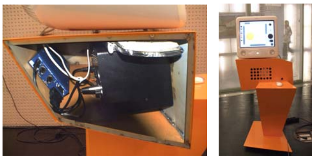
Fig. 3 A PSOs Client with the ETHERSOUND Hub, Speakers and Keyboard concealed on the structure.

The sound generated at the Servers site conveys the overall performance of every user and is streamed back to each client using an ETHERSOUND [6] system, which produces latencies under 100 ms on the building's LAN.