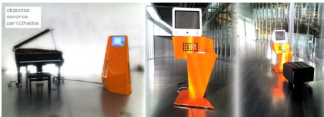
Fig. 2 The PSOs Server connected to the Disklavier Piano and two of the clients which remotely control the same Piano

The final implementation consists of a Disklavier Piano controlled via MIDI by a server that simultaneously can be used as a terminal, located at the main foyer of Casa da Musica. This server accepts incoming control data generated by 10 client computers located in diverse points of the hallways of a scenic route of the building. Incoming data is transmitted over the building's IP Network using Open Sound Control [24].